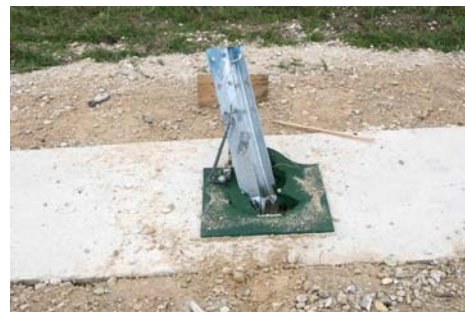
Two-Part Urethane Foam after Test

It should be noted that the durability of these products was not evaluated. Field experience is necessary to assess their long-term durability in the highway environment.