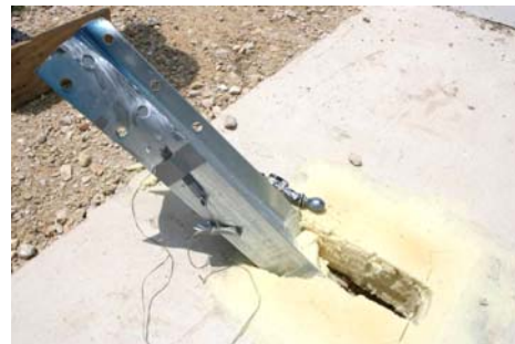
TopHat™ recycled rubber mat after test