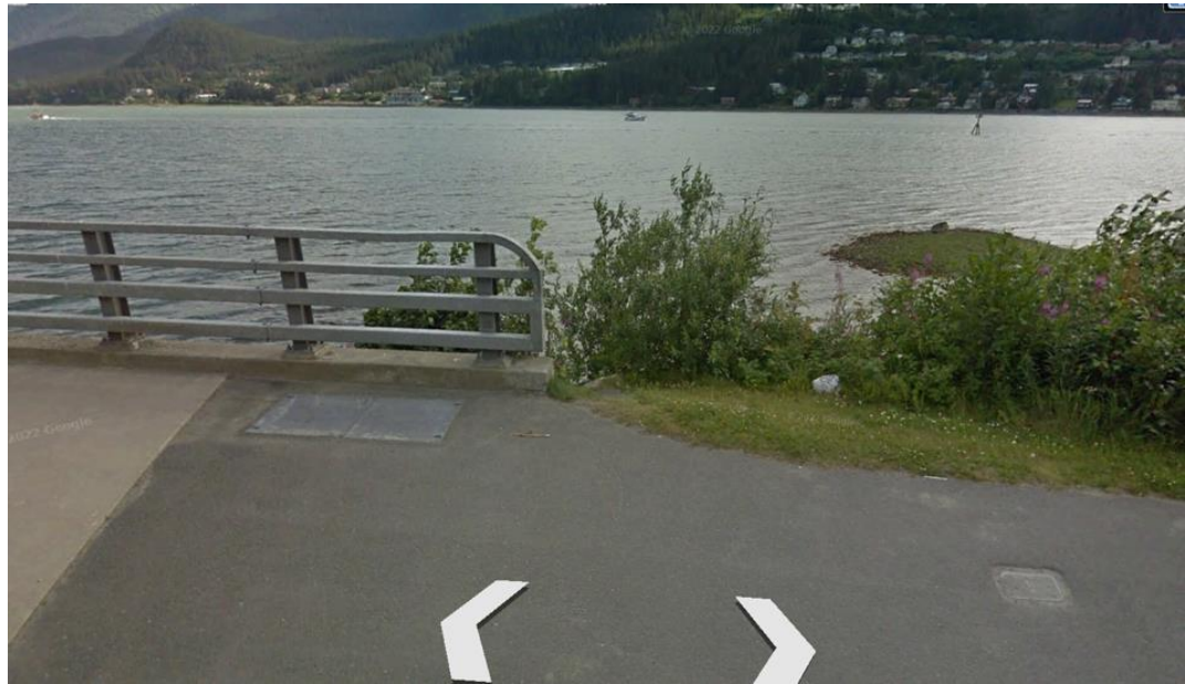
Figure 1: “Do-nothing approach” due to steep slope; is there a better way?

This project fills in the gap for sites under such constraints. With this project, we propose to develop guidance to assist practitioners in determining whether a “do nothing” approach is sufficient. Furthermore, we’d like to develop and simulate a short, simple, non-proprietary end treatment or attenuator that directly connects to the bridge rail end. A simple, short attenuator might provide some safety benefit to sites when a MASH attenuator does not fit.