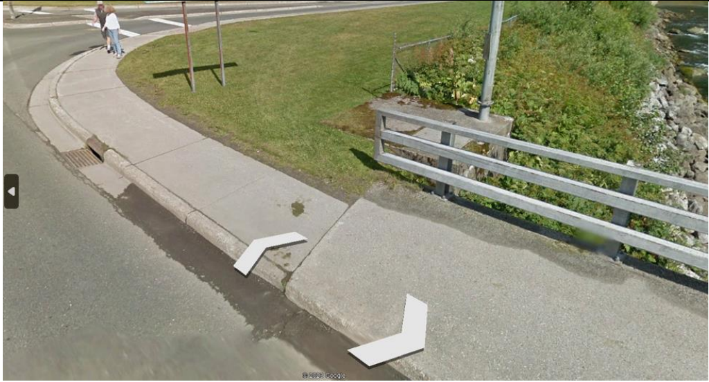
Figure 4: Another example of the "do-nothing" approach at a short-radius turn.