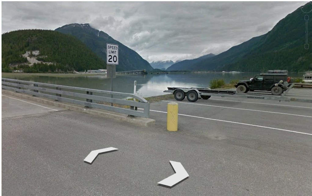
Figure 3: Bollard end treatment; low-speed parking lot application.

These locations are not necessarily high speed or high volume, and thus this effort is needed to optimize the allocation of the resources to maximize the safety benefit of using specialty hardware.