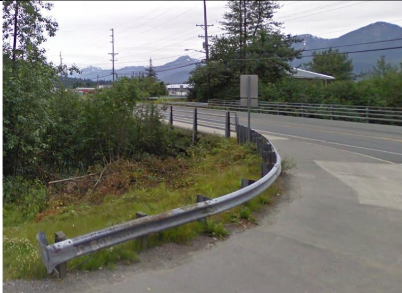
Figure 2: Steep slopes and short-radius turn resulted in improvised transition.